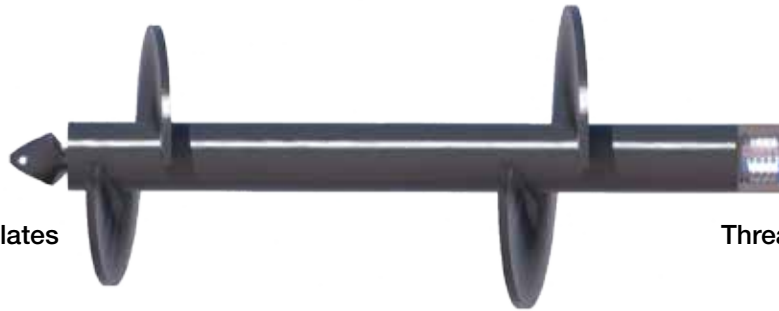
10" - 12" Multi-helix Plates

The retrofit of the Bethel Library into a safe room would increase the overall load of the structure as well as its footprint, which, in turn, would require increased foundational support. Four different foundation companies submitted proposals; Ram Jack Tennessee was awarded the project.